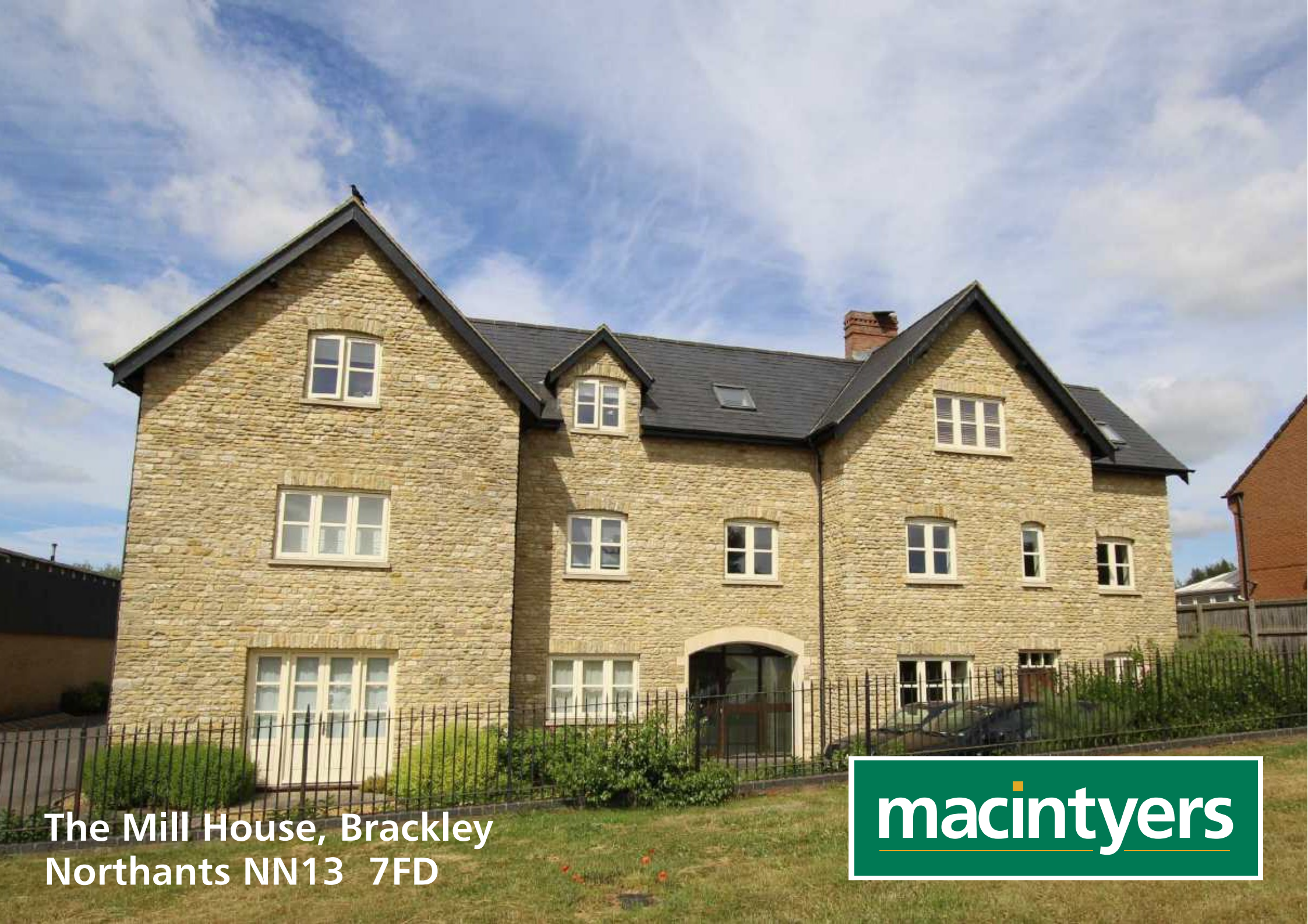
The Mill House, Brackley Northants NN13 7FD